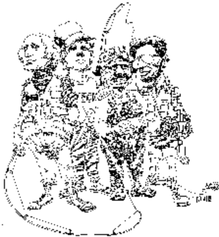
The BIG Auction '02